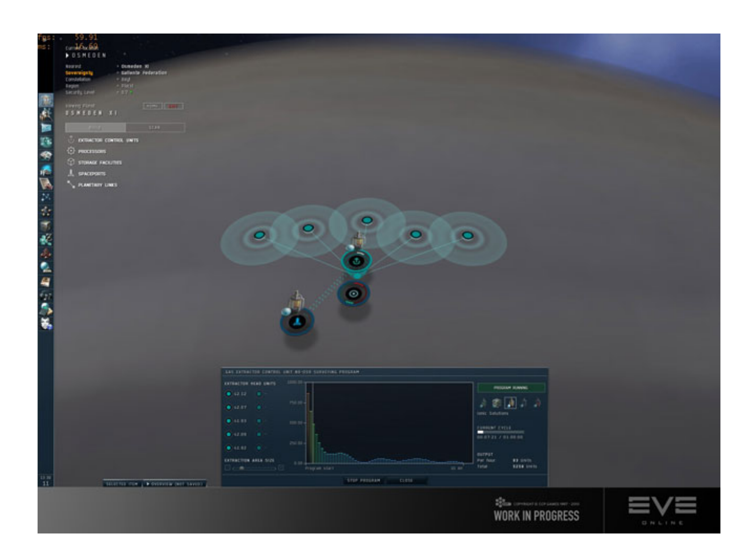
Eve Tools Planetary Interaction Tutorial